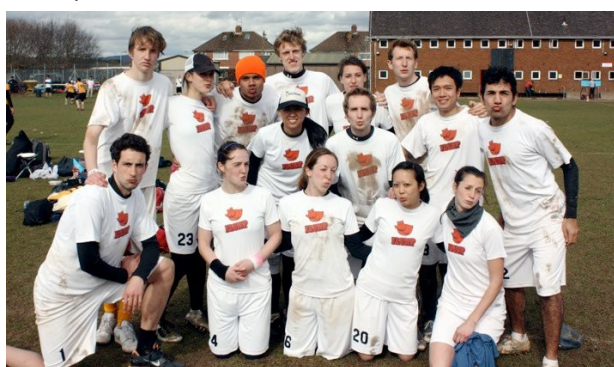
Flump Flump's team from Mixed Tour 1, where they sealed 8th place. Cracking photo!

(Another note – We are informed today that Harry is now going to World's with The Herd! Sleeping with the enemy, eh Harry?)